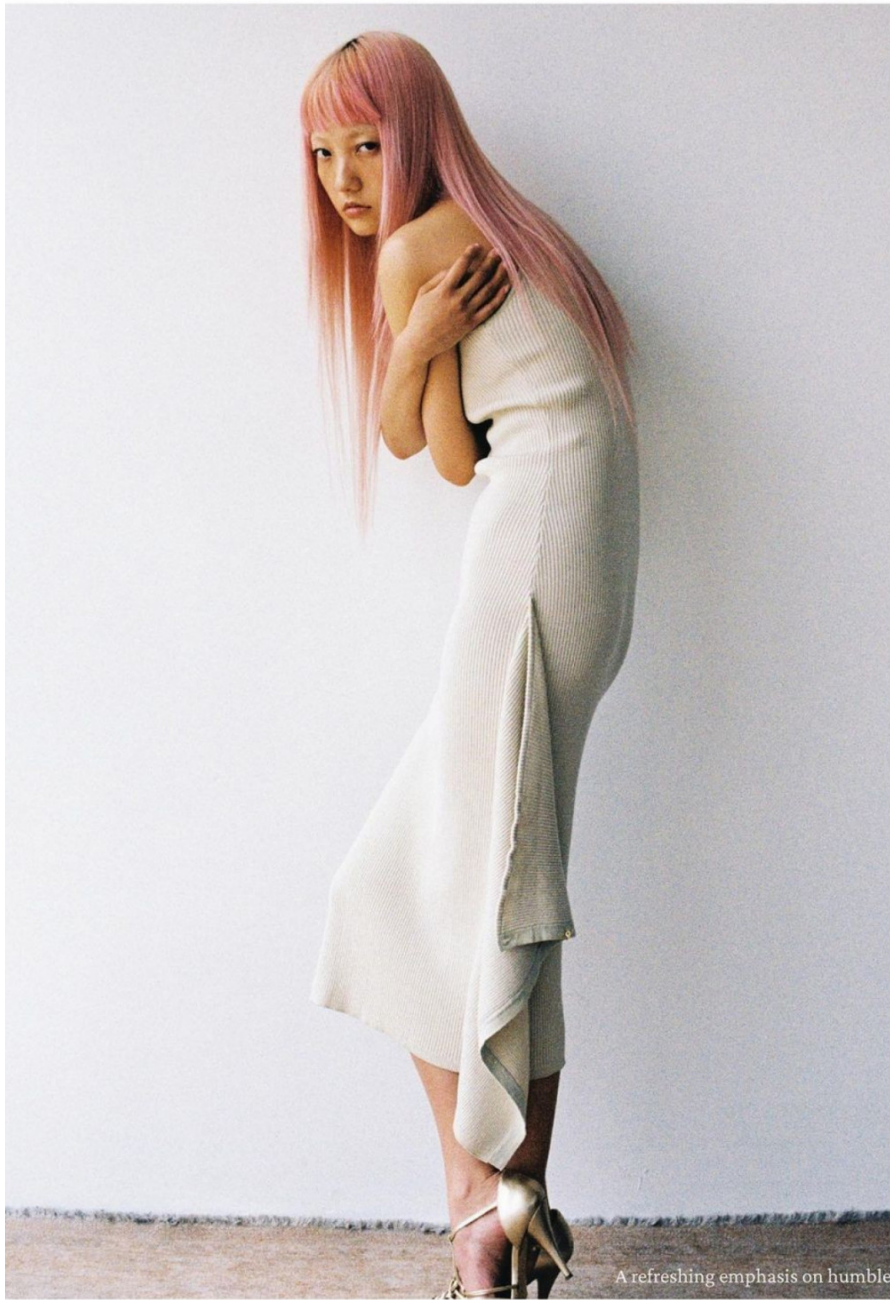
A refreshing emphasis on humble