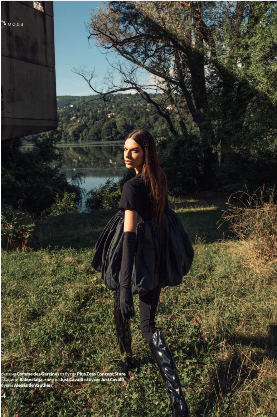
Окля на Comme des Garçons от бутика Plus Zero Concept Store, вязанцы Balenciaga, клич на Just Cavalli от бутика Just Cavalli, букли Alexandre Vauthier