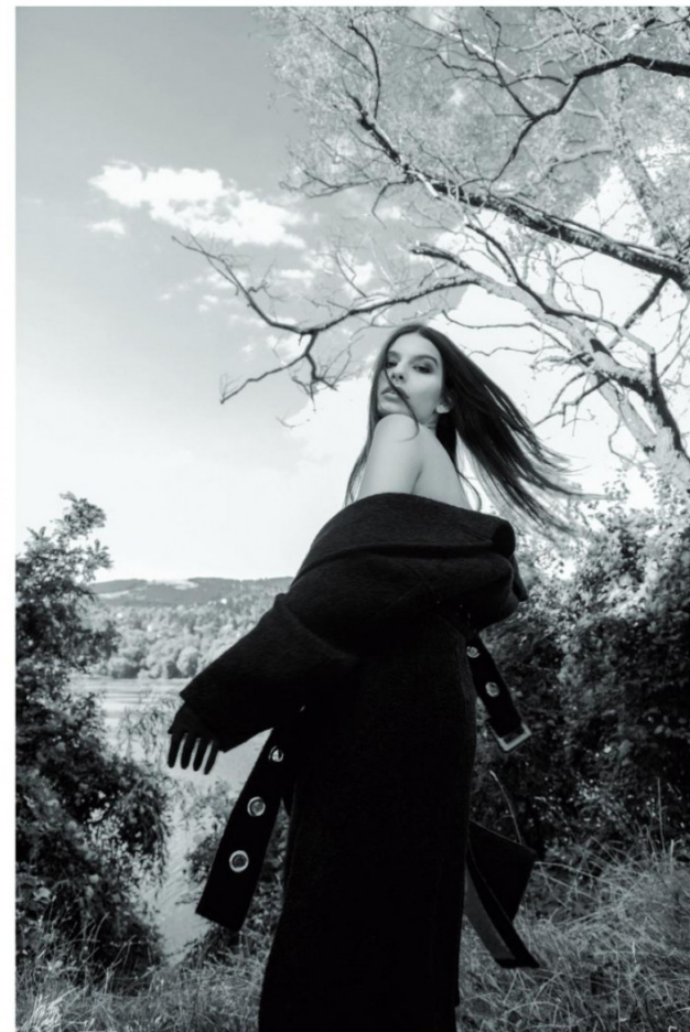
палто Just Cavalli от бутик Just Cavalli