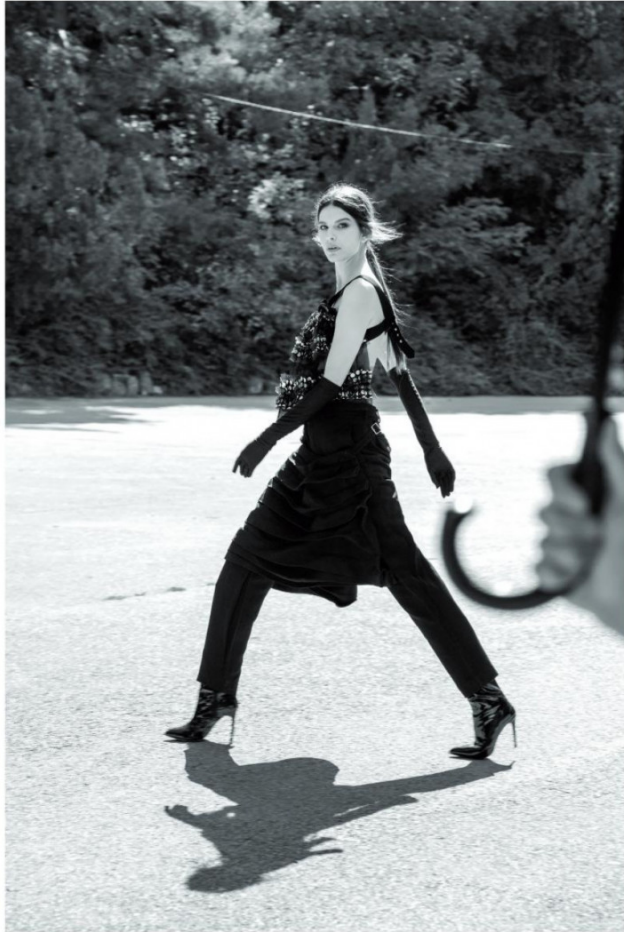
бюстие и панталон Comme des Garçons , ръкавици Balenciaga , обувки Alexandre Vauthier